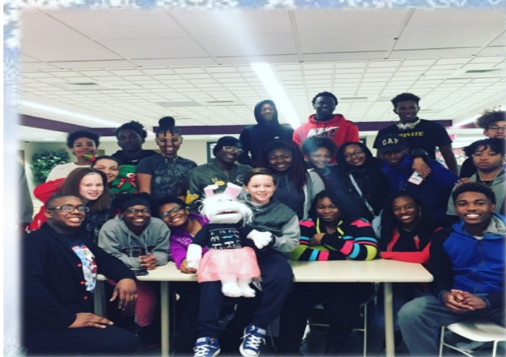
Students enjoy a UBMS Holiday